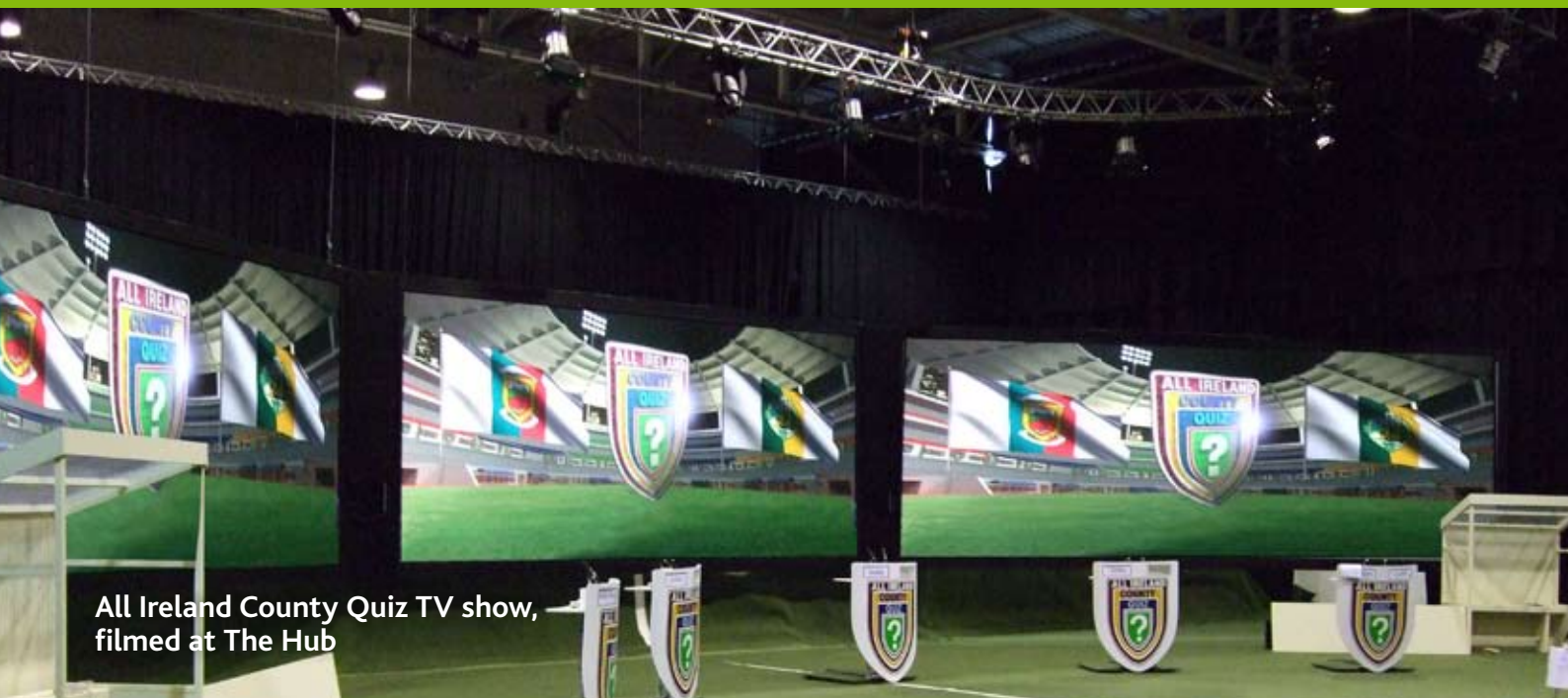
All Ireland County Quiz TV show, filmed at The Hub